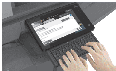
Built-in retractable keyboard simplifies email address and subject line entries.