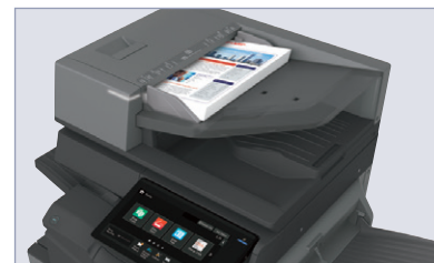
High capacity 300-sheet DSPF scans documents at up to 280 images per minute.