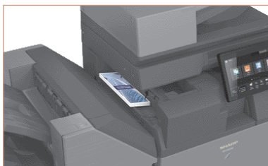
New Inner Folding Unit option offers a variety of fold patterns, including tri-fold, z-fold and others.