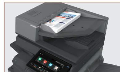
High capacity 300-sheet DSPF scans documents at up to 280 images per minute.